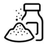
Extract & Extract Powder