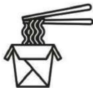
Instan Noodle Soup